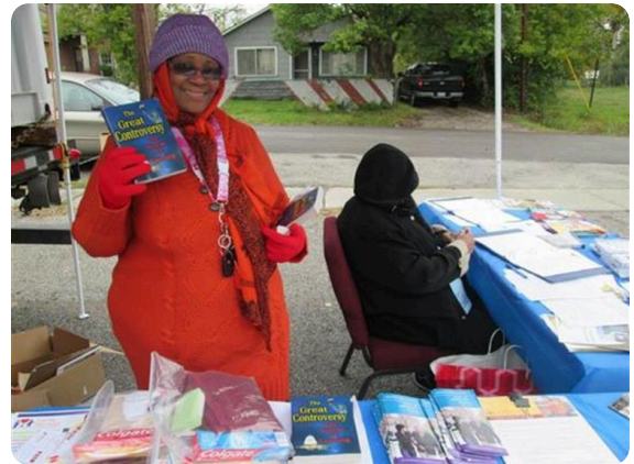
Community health fair