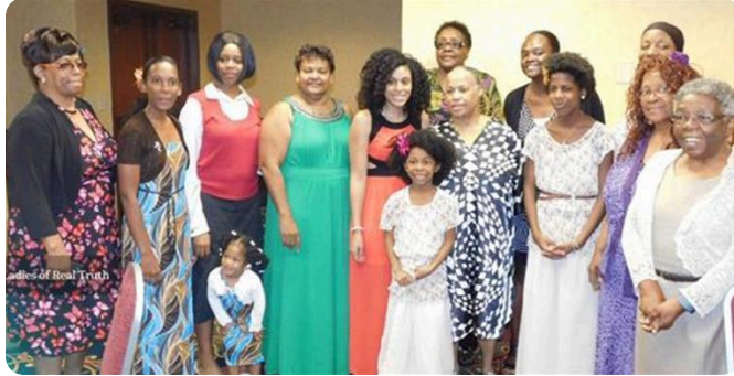
Mother's Day Celebration