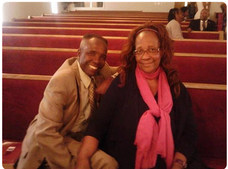
Two hearts united in love