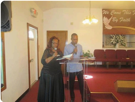
Sabbath school singing