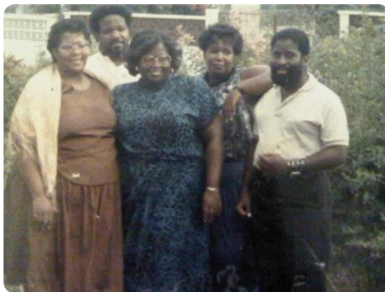
Five of Us Siblings in STX