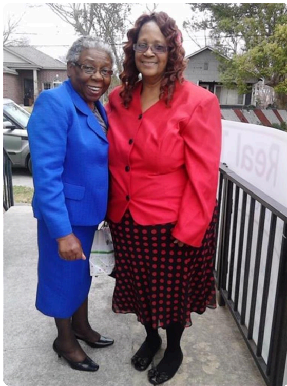
With Sis. Best